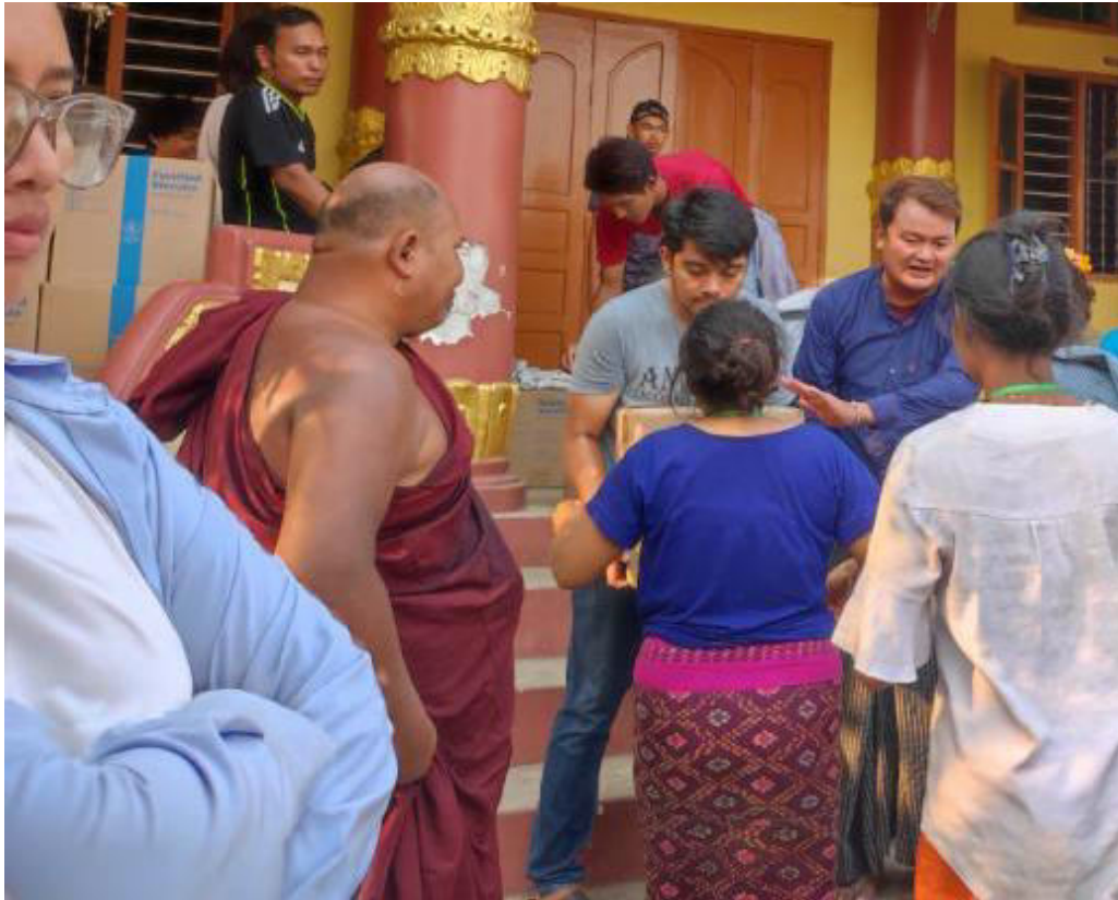
Food is being provided to those seeking refuge in the Cathedral compound, including individuals of Buddhist, Muslim, and Hindu faiths, April 4, 2025.