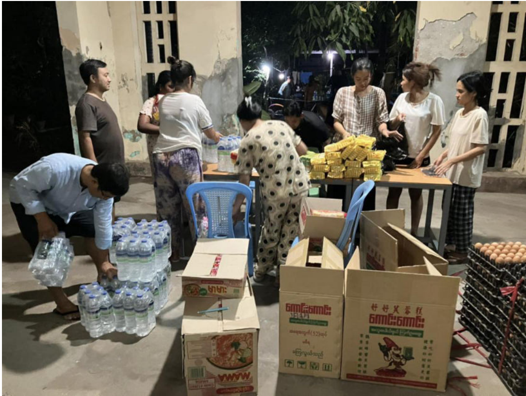
Distributing Cash for Food - 36000 MMK per person for 15 days - in Sagaing, April 2-5, 2025.