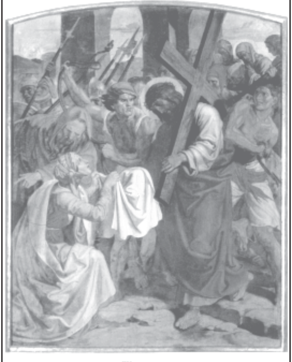
6<sup>TH</sup> Station: Jesus and Veronica

Copies of the guide to the way of the Cross containing color pictures are available in the parish-office. (German only)