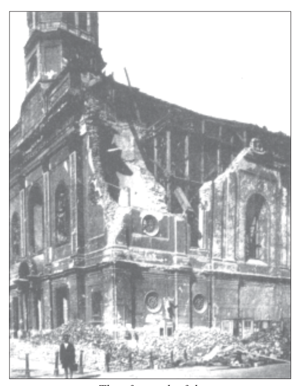
The aftermath of the bombing in März 1945

The way of the Cross painted by Josef von Führich between 1841 and 1846 is the most important artifact. It consists of fourteen 240 \times 185 cm frescos. Replicas of this way of the Cross can be found all over the world.